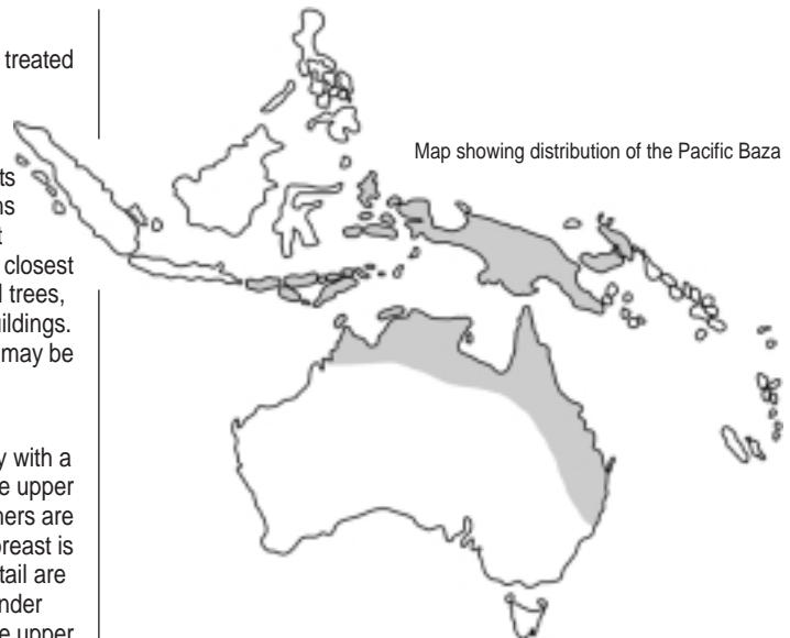
Map showing distribution of the Pacific Baza

The Pacific Baza is the sole Australian representative of a group of hawks variously known as Cuckoo Falcons, Bazas or Lizard Hawks. The former name is not inappropriate as these hawks do bear a superficial resemblance to some species of cuckoo. Pacific Bazas are found through coastal northern and eastern Australia, from near Derby in the north-west to about Sydney in the south-east, but are rarely found beyond the western slopes of the Great Dividing Range in semi-arid Australia. Little is known of their distribution through the Gulf of Carpentaria. Pacific Bazas also occur in eastern Indonesia, New Guinea and associated island groups.